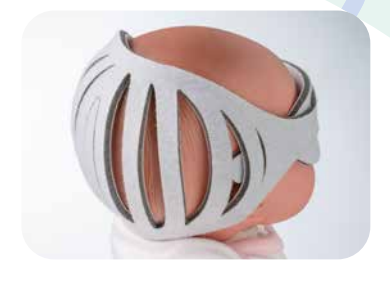
Phototherapy eye protector with nape support Page 9