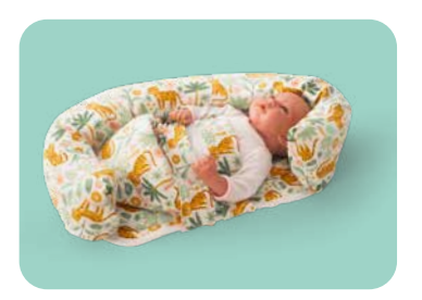
Newborn positioning aids Page 4