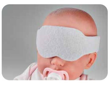
Phototherapy eye protector with rear support Page 8